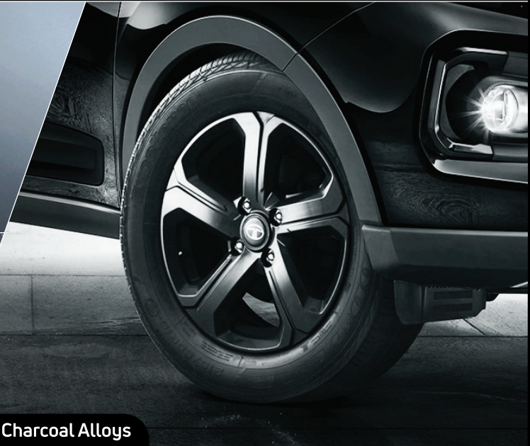
R16 Charcoal Alloys