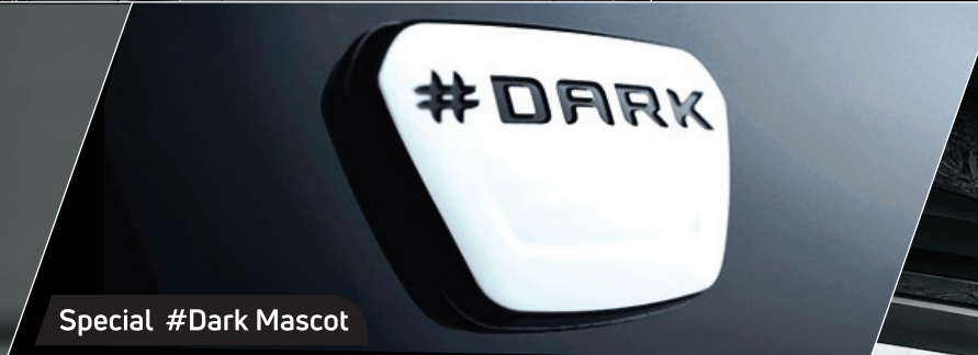
Special #Dark Mascot