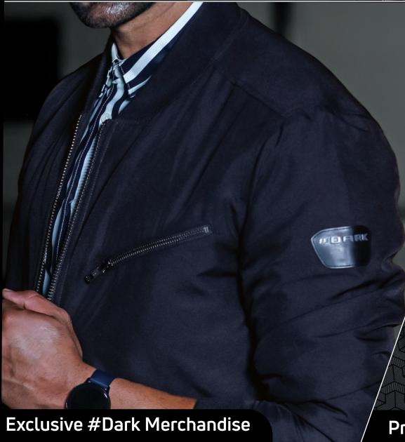
Exclusive #Dark Merchandise