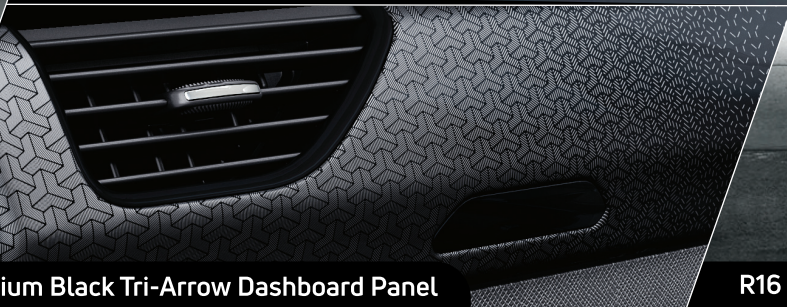
Premium Black Tri-Arrow Dashboard Panel