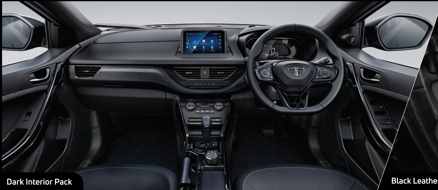
Dark Interior Pack